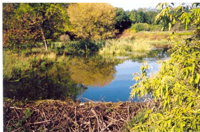
Beaver Dam on Carruthers Creek at Shoal Point Road; Photo: Reg Lawrance