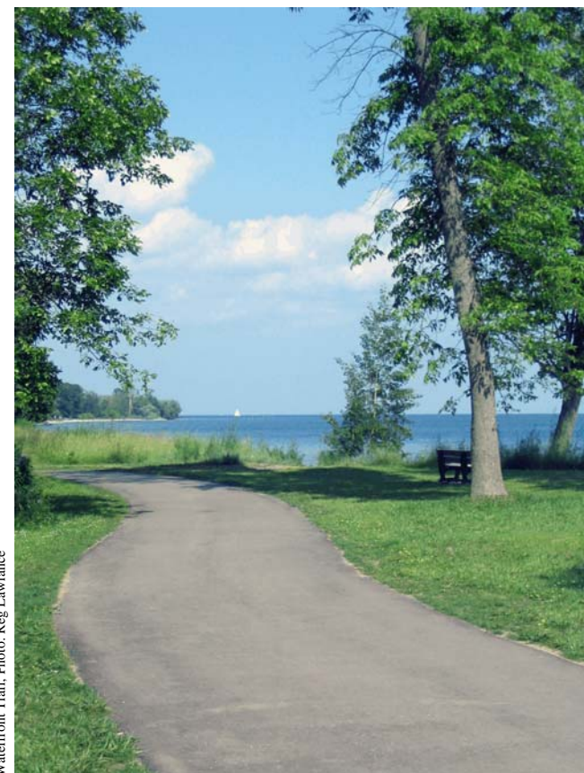
Waterfront Trail

Promoting the Year Round Enjoyment of Trails and Bikeways!