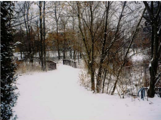
Carruthers Creek