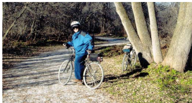
North Duffins; Photo: Stu Logan