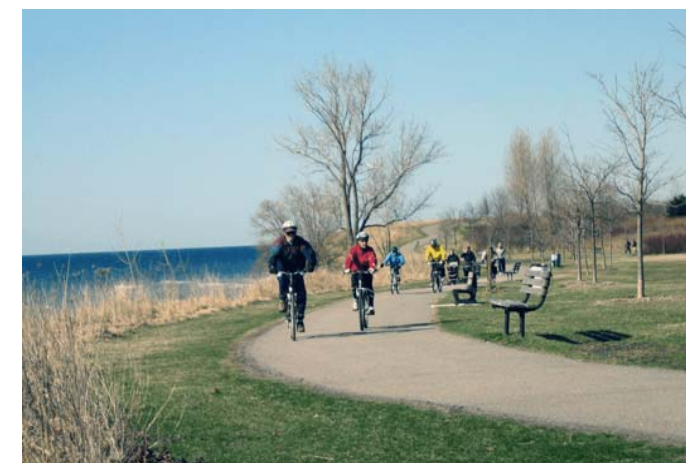
Waterfront Trail; Photo: Richard Cooke

[Ajax shall] encourage the use of trails as alternative transportation corridors.